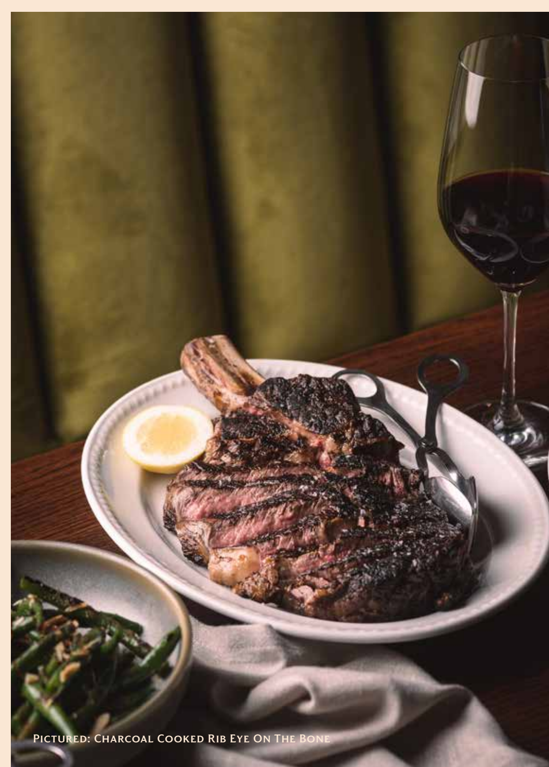
PICTURED: CHARCOAL COOKED RIB EYE ON THE BONE

The menu may change depending on seasons and availability of ingredients.