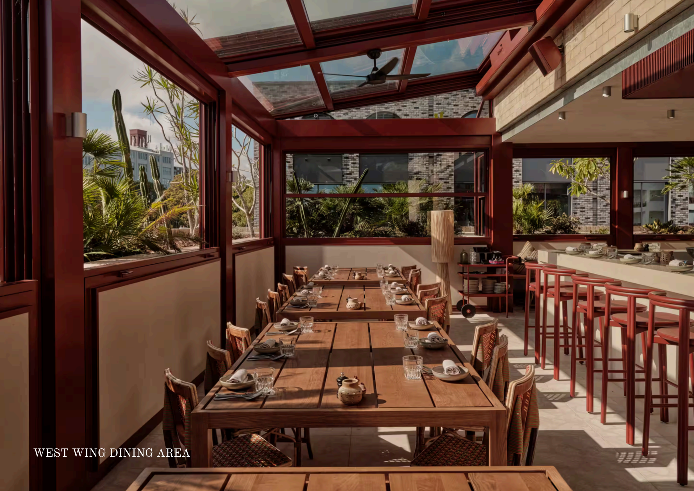
WEST WING DINING AREA