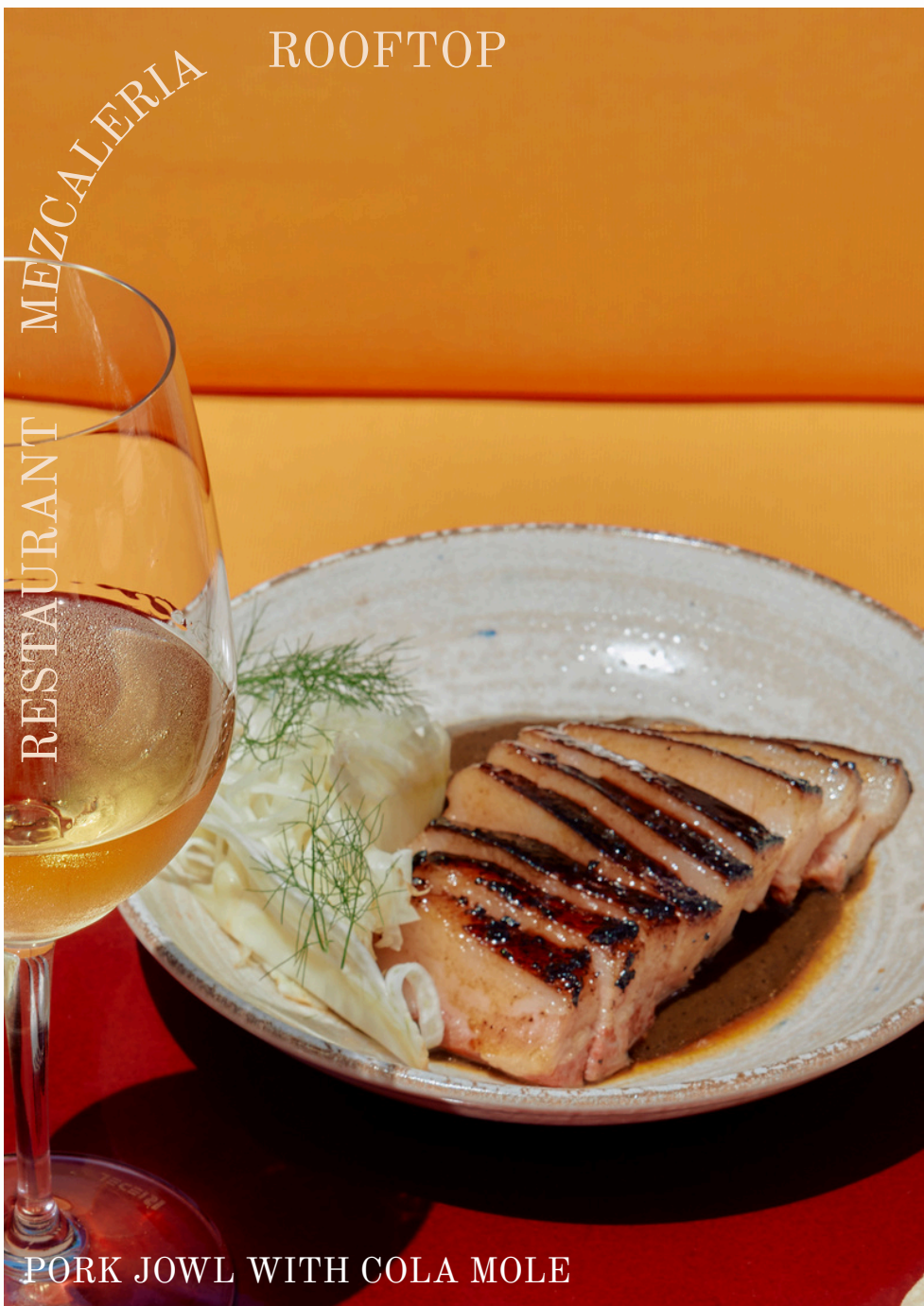
PORK JOWL WITH COLA MOLE