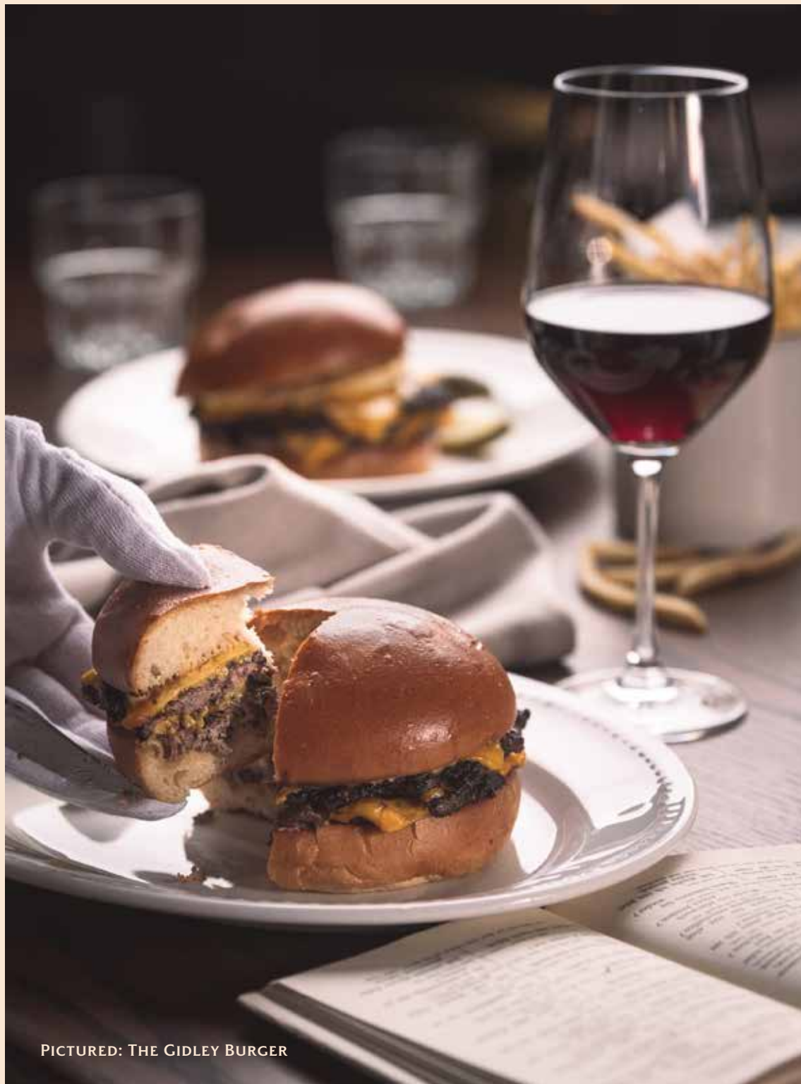
PICTURED: THE GIDLEY BURGER