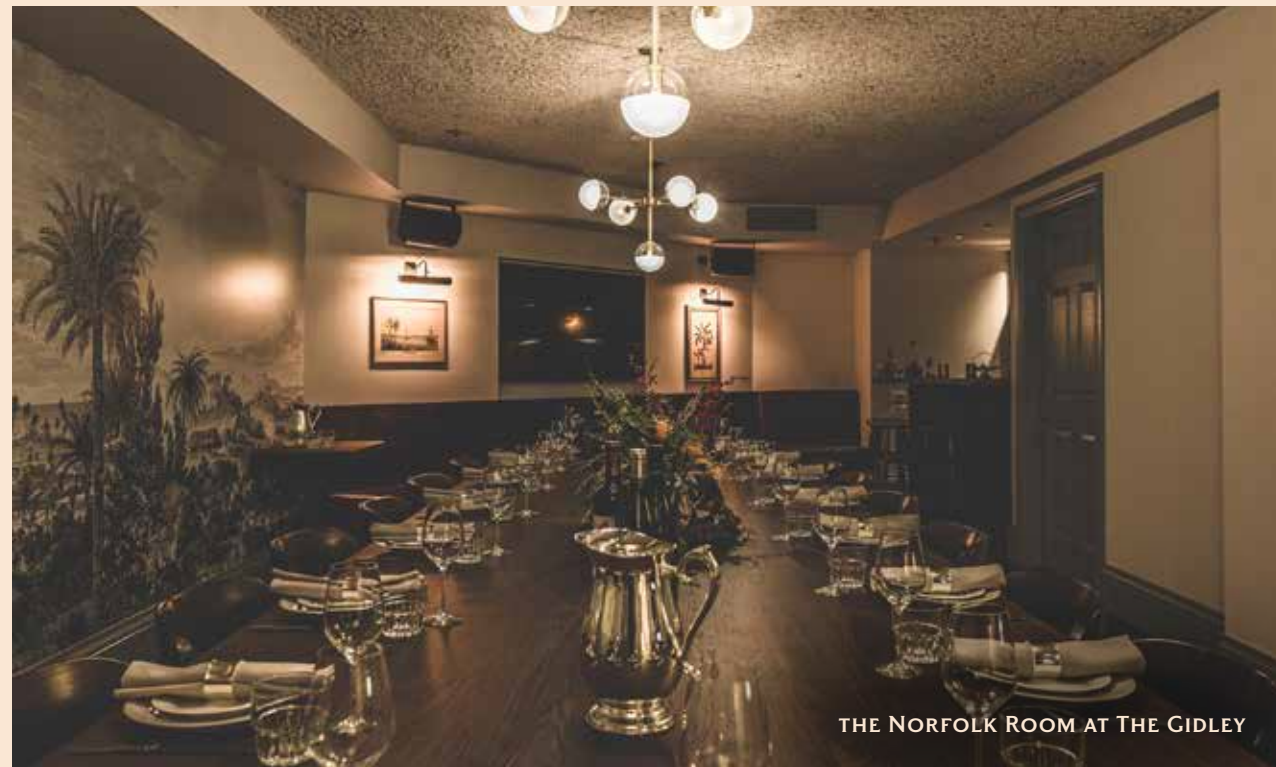
THE NORFOLK ROOM AT THE GIDLEY