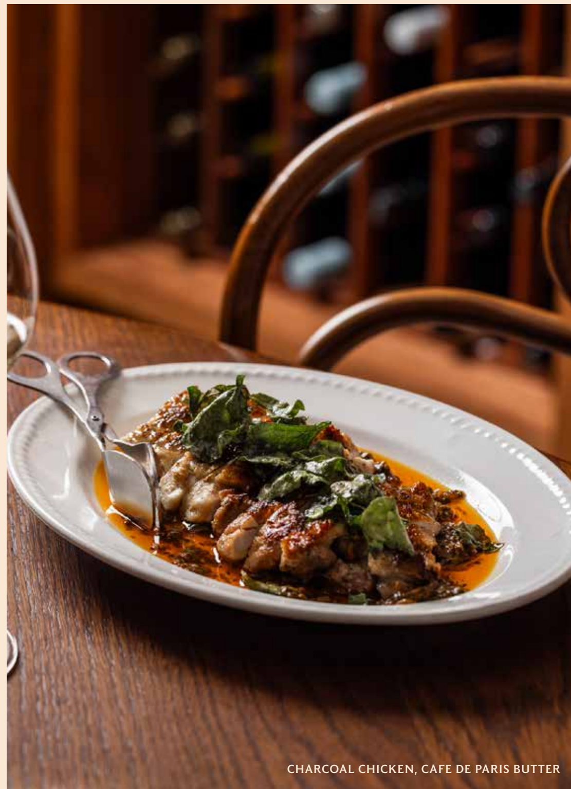
CHARCOAL CHICKEN, CAFE DE PARIS BUTTER

The menu may be change depending on seasons and availability of ingredients.